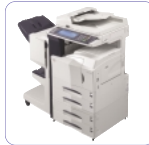
Shown with booklet finisher (DF-75)

The optional reverse unit (RA-1), for use with the DF-75 booklet finisher, allows fast face-down output, delivers your documents in the correct order and at 100% engine speed.