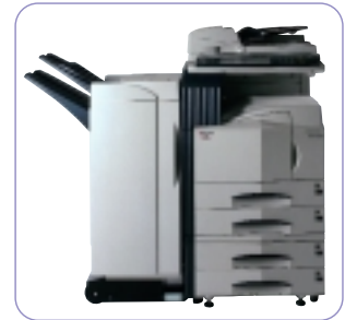
Shown with high capacity finisher (DF-71)