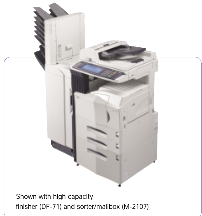
Shown with high capacity finisher (DF-71) and sorter/mailbox (M-2107)

The KM-2530 and KM-3530 have been developed in parallel with the FS-9100DN and FS-9500DN printers so that you benefit from a suite of printer- and copier-based multi-functional document devices that are fully compatible with each other, sharing drivers and paper handling options. These advances mean their operation becomes more and more similar, making for greater ease of use and more simplified production of professional documents.