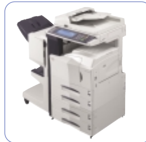
Shown with booklet finisher (DF-75)

The optional reverse unit (RA-1), for use with the DF-75 booklet finisher, allows fast face-down output, delivers your documents in the correct order and at 100% engine speed.