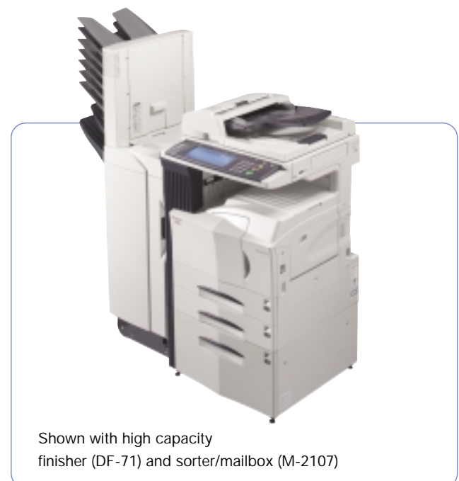
Shown with high capacity finisher (DF-71) and sorter/mailbox (M-2107)