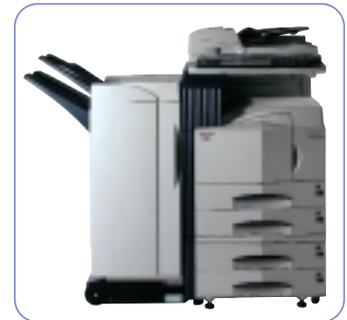
Shown with high capacity finisher (DF-71)